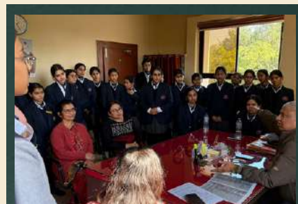
Interaction with the Additional Collector of Gwalior