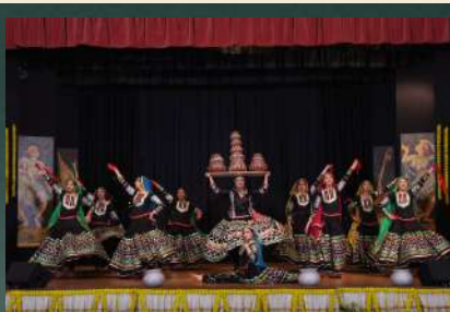
I/H Folk Dance