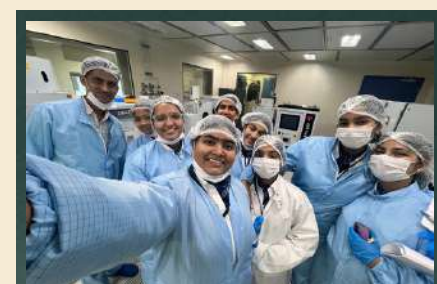
BITS Pilani Hyderabad Internship