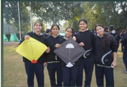
Makar Sankranti - Kite Flying