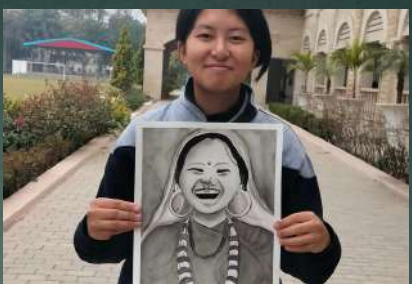
I/H Portrait Making