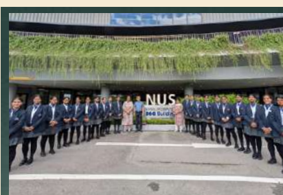
NUS Internship Program