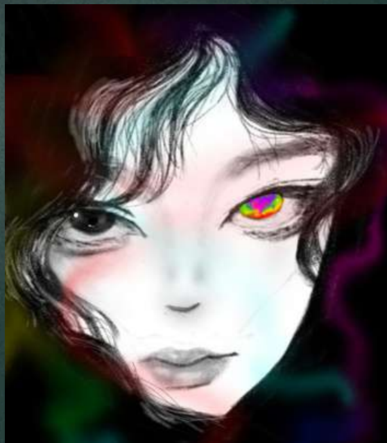
Digital Art Saanvi Singh IX