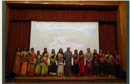
School Assembly by The Lawrence School, Lovedale