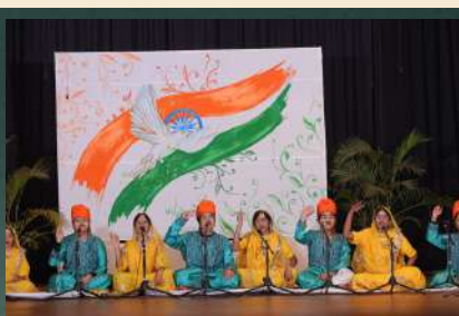
I/H Indian Folk Song