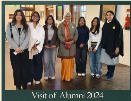
Visit of Alumni 2024