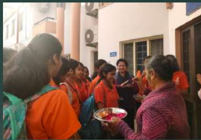
Welcoming The Lawrence School Lovedale