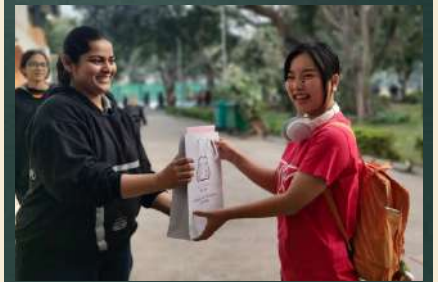
Welcoming the Exchange Student from Japan