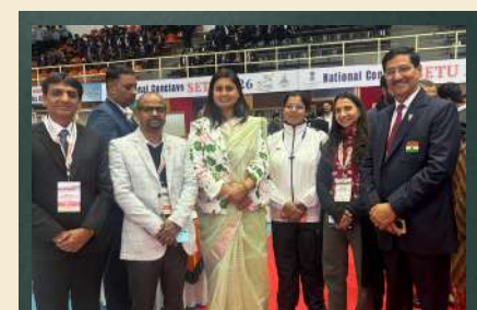
National Conclave SETU 2026