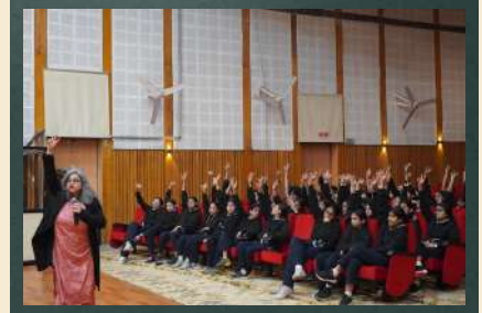
Mental Health Workshop