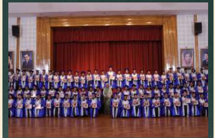
Special Assembly for Class XII