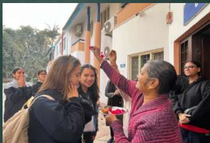
Welcoming the Exchange Students from Colombia

The Lawrence School, Lovedale, Ooty, India Gakuin Mitsuura Junior Senior High School, Yokohama, Japan Colegio Anglo Colombiano, Bogota, Colombia