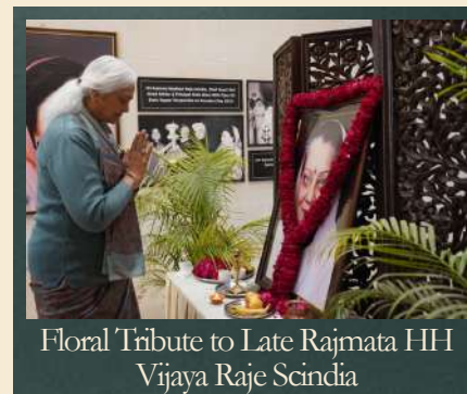
Floral Tribute to Late Rajmata HH Vijaya Raje Scindia