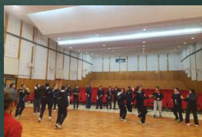
Ice Breaking Session