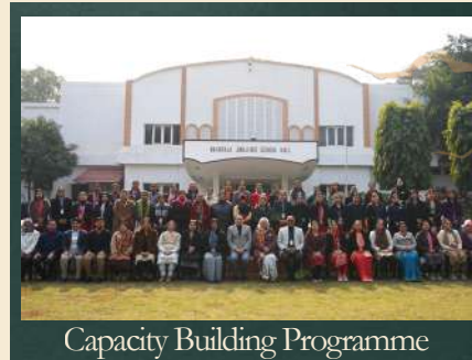
Capacity Building Programme