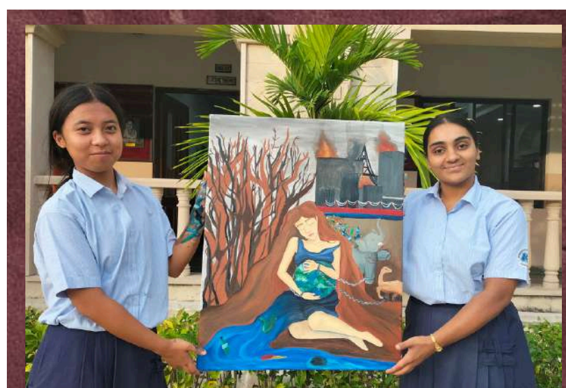
I/H On the Spot Painting