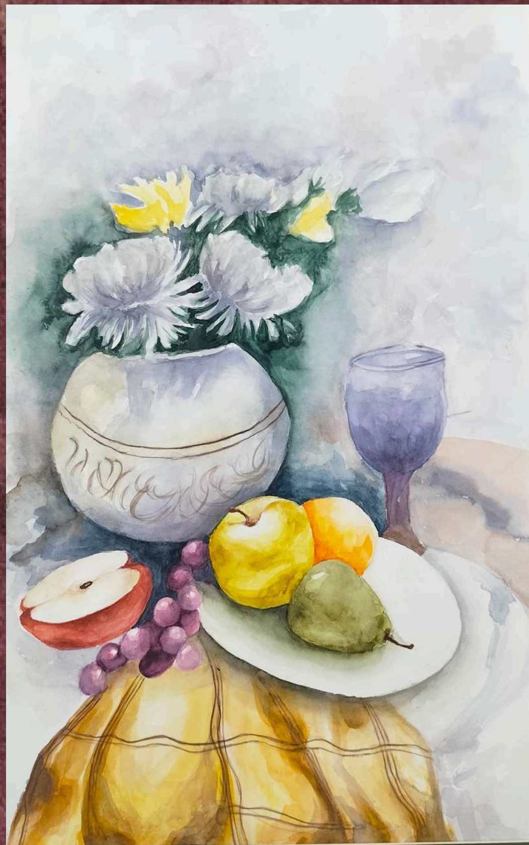
Divyansha Agarwal (grade XII) Water Colour