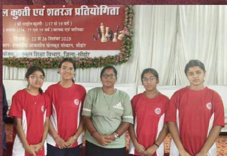
SGFI State Chess