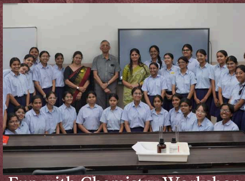
Fun with Chemistry Workshop