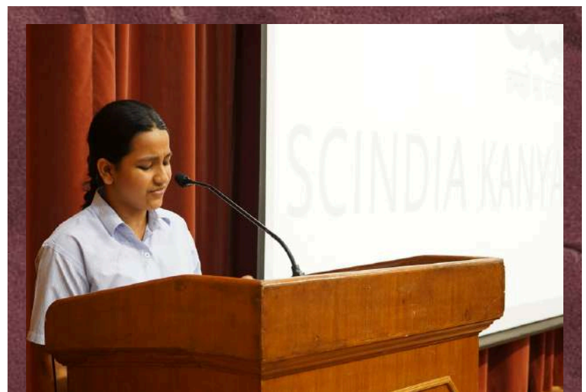
I/H Button Poetry