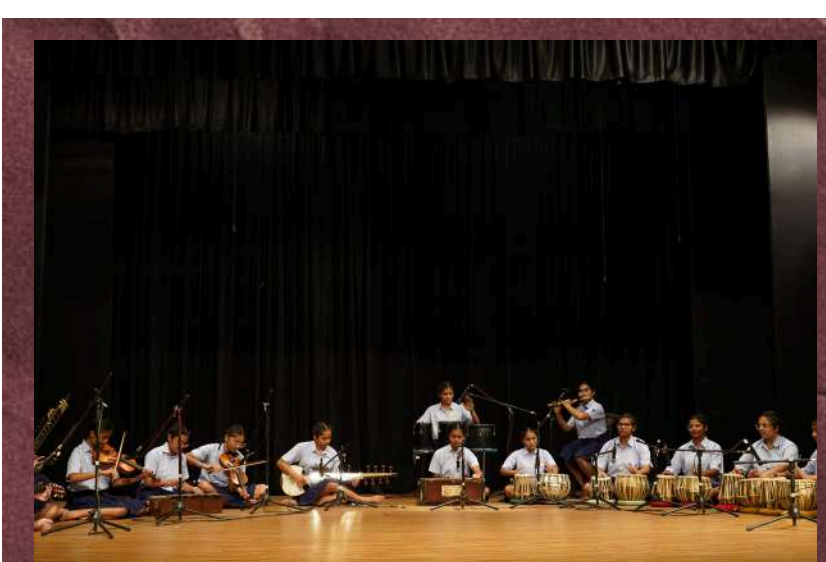
I/H Indian Orchestra