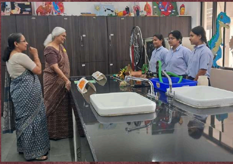
I/H Science Inovation