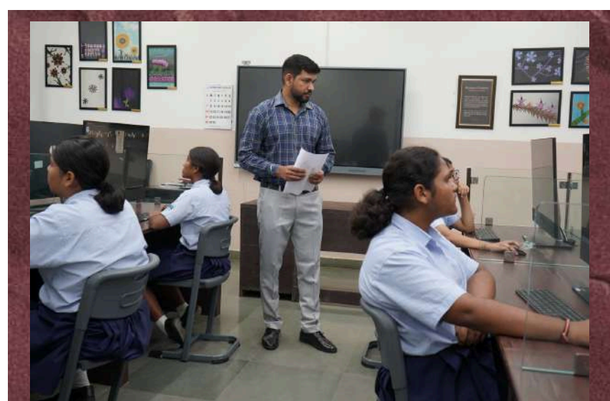
I/H Mathematics Puzzle Game