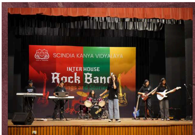
I/H Rock Band