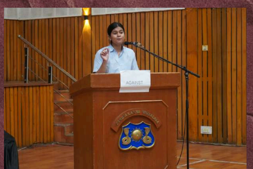
I/H English Debate