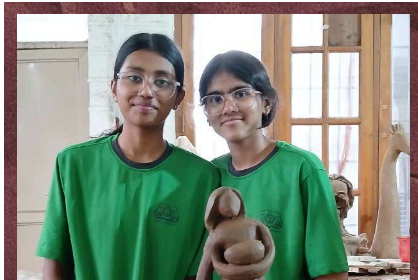
I/H Clay Modeling