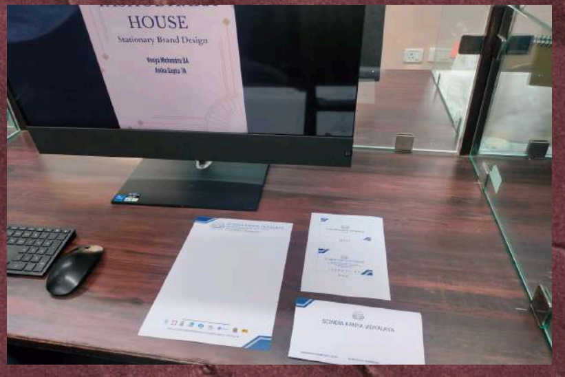
I/H Institution Brand Design