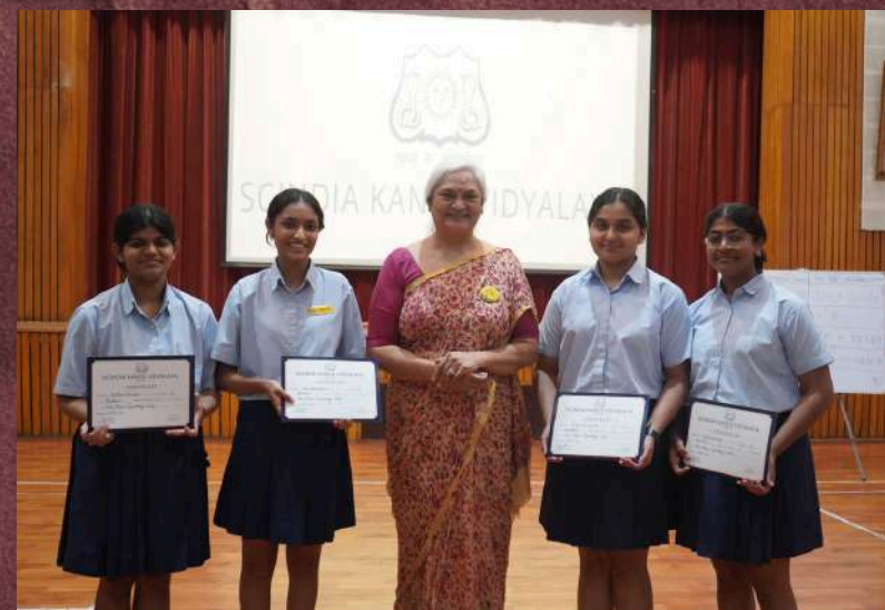
I/H Psychology Quiz