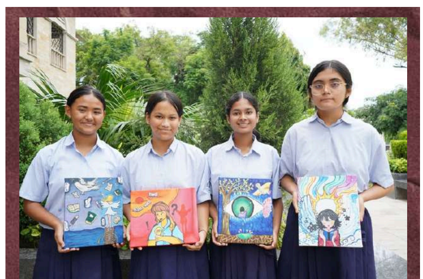
I/H Acrylic On Canvas