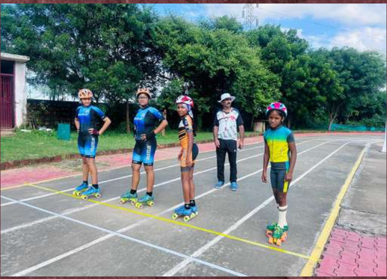
SGFI District Skating