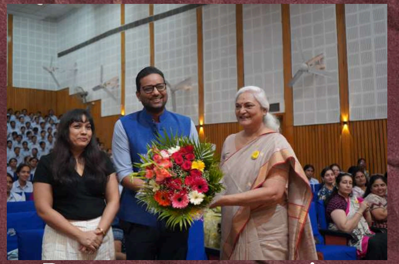
Parent on campus session