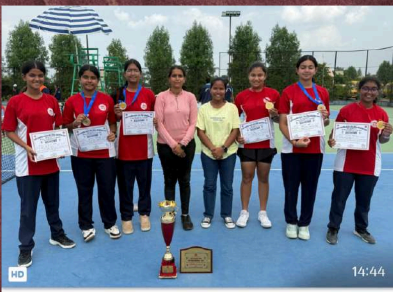
SGFI State Tennis