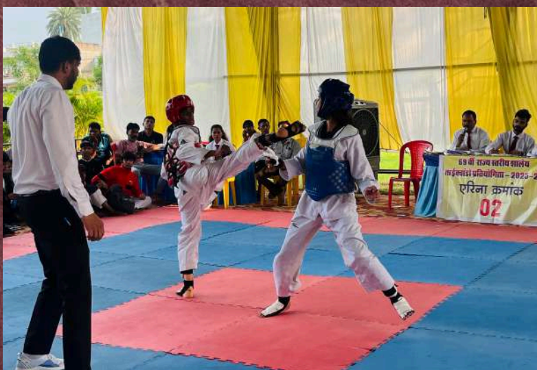
SGFI State Taekwondo