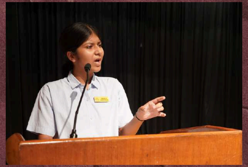
I/H English Extempore