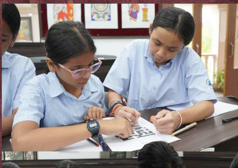
I/H French Spell-Bee