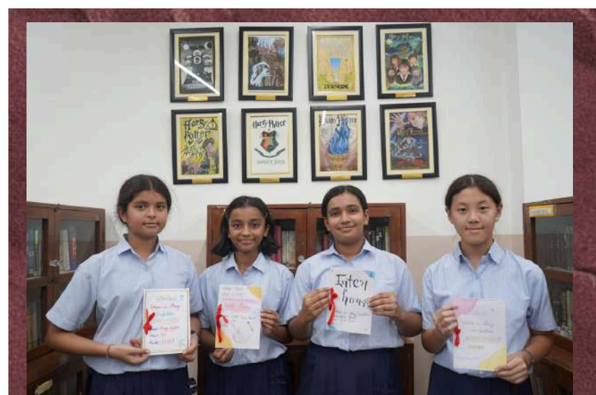
I/H Weave a Story