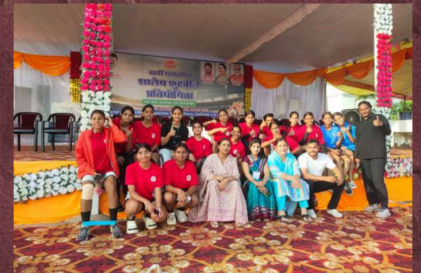
SGFI State Football