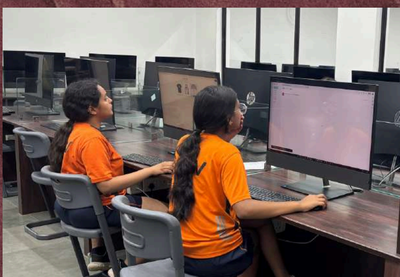
I/H Website Design