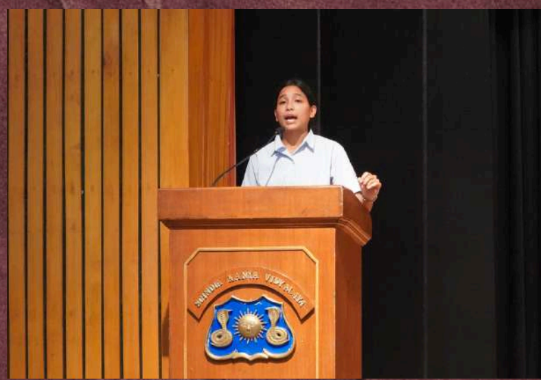
I/H English Turncoat