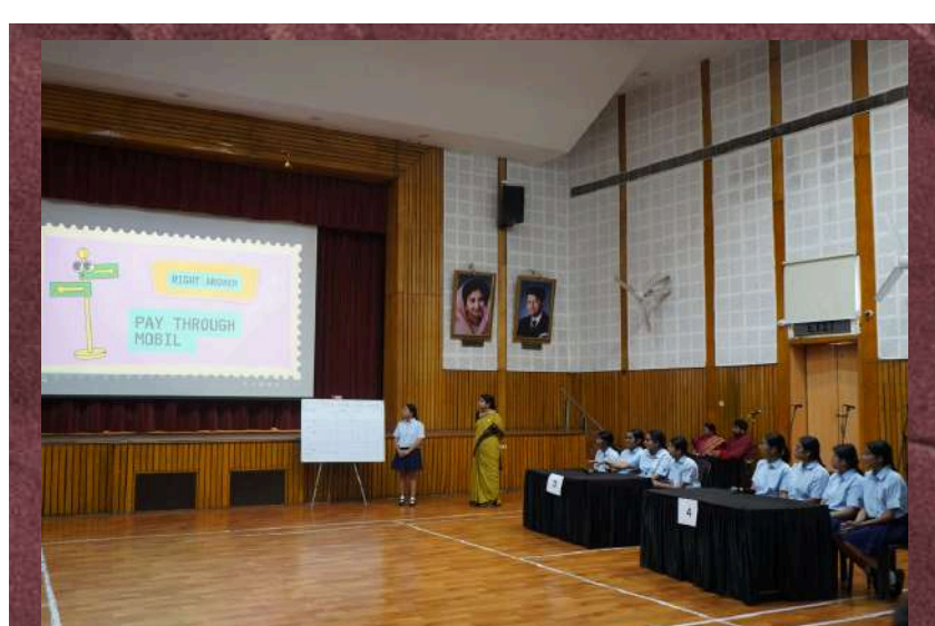
I/H Business Quiz